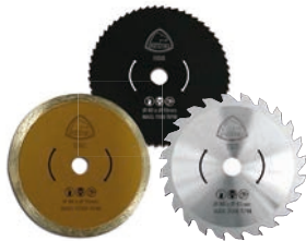
CRC / HSS / TCT Discs