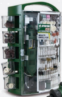
Multi Tools pág. 12