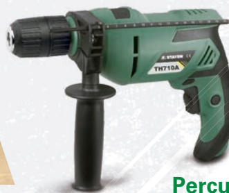
Percussion Drill pág. 7