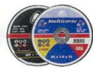
Abrasive discs Metal cutting / Multicut