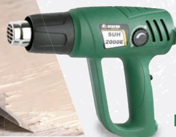
Hot Air Gun pág. 15