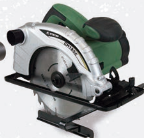
Wood Line pág. 10