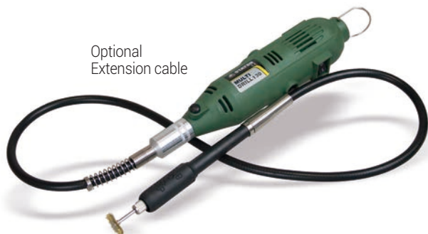
Optional Extension cable