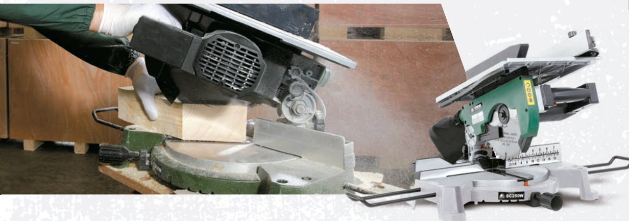
Mitre Saw pág. 4

NEW RANGE MORE COMPETITIVE HIGHER QUALITY