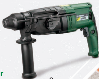
Rotary Hammer SDS-PLUS