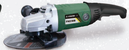
Angle Grinder pág. 9